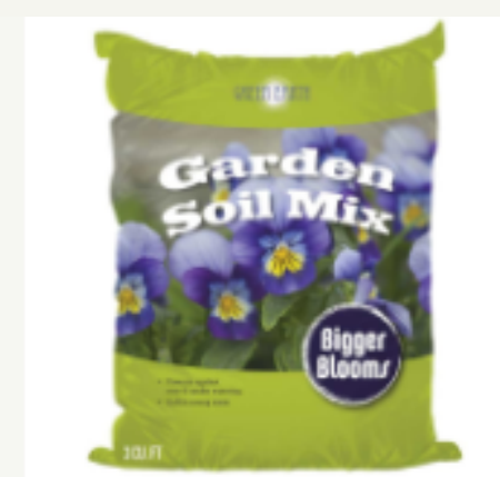
Soil or Mulch Bags