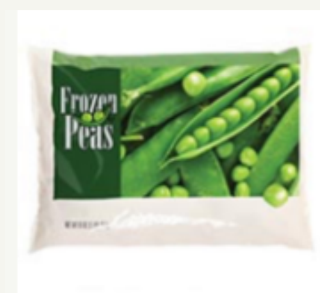
Frozen Food Bags