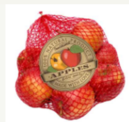
Net/Mesh Produce Bags