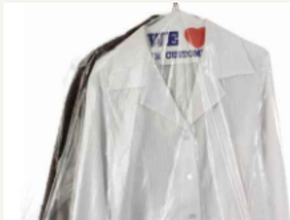
Dry Cleaning Bags